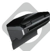
Smart Card Reader(CAC) + GPS